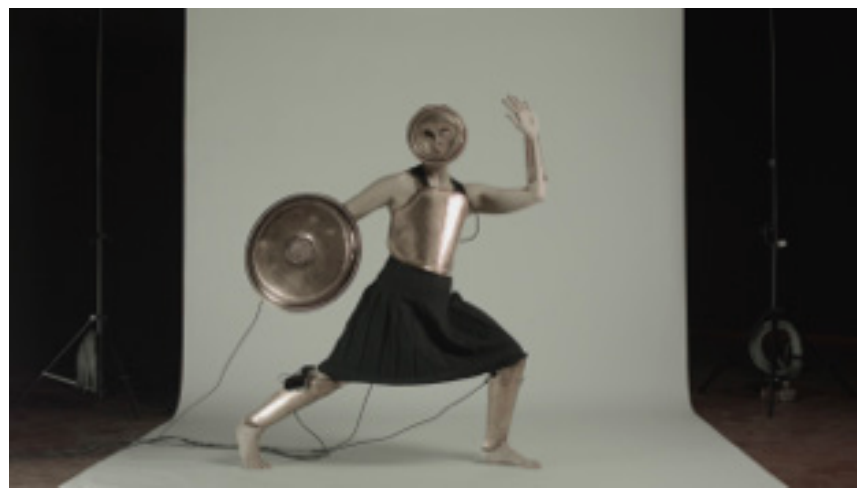
EE-0 (Europa Enterprise), 2018, video still