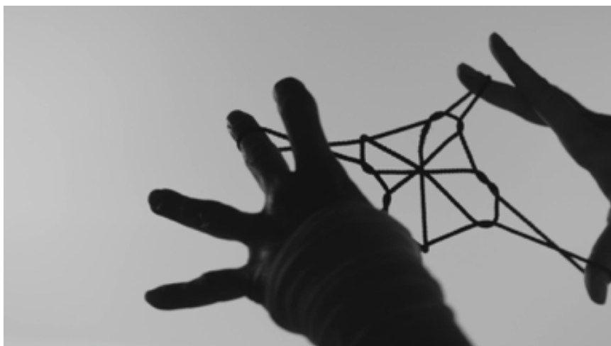
Gorgo, 2019, video still