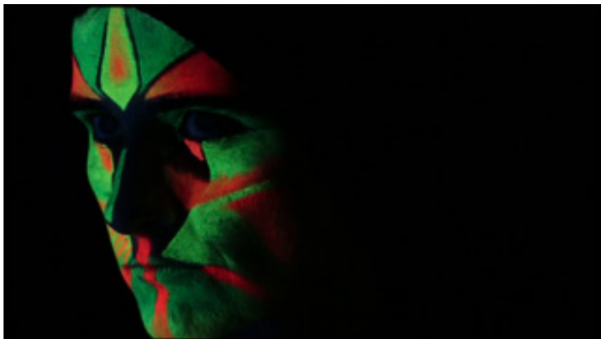
The Eumenides, 2014, video still